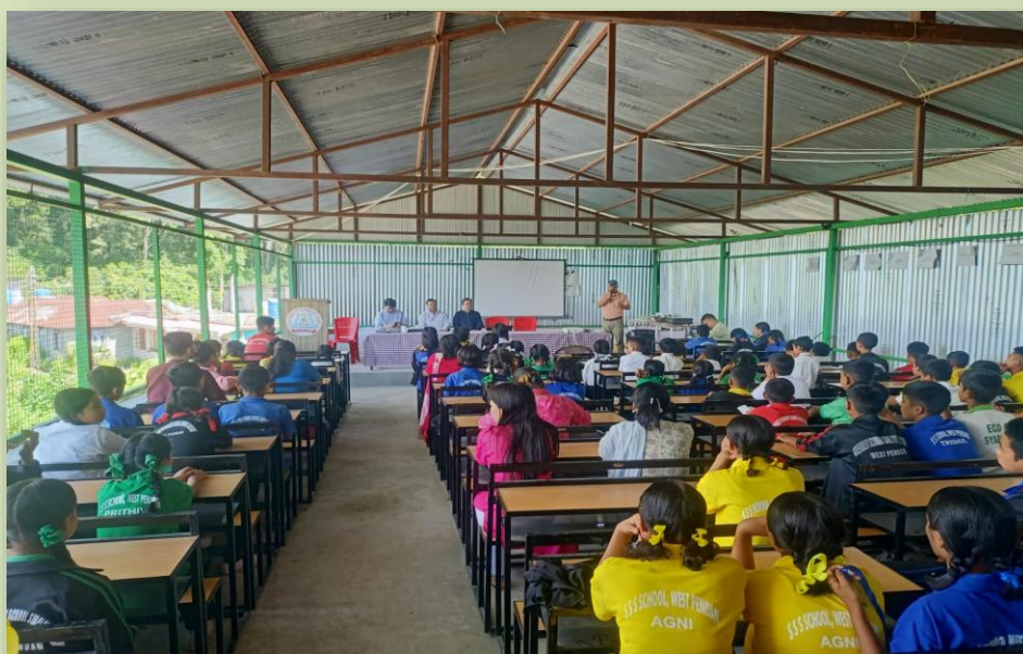
Government Secondary School, Syaplay Sardaray, Gangtok