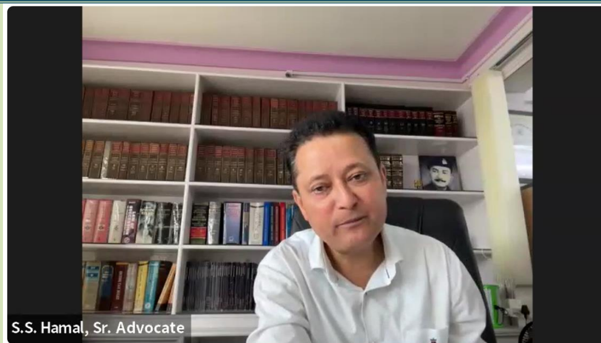
Training programme conducted via virtual mode on the topic ‘Order VI, VII, & VIII of Code of Civil Procedure’ by Shri S.S Hamal, Senior Advocate, High Court of Sikkim on 3 rd August,2024.