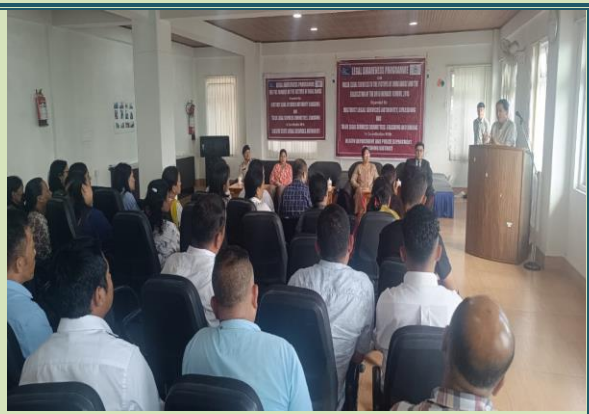
Hall of ADR Centre, Gyalshing District