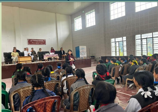
Government Secondary School, Singhik, Mangan District