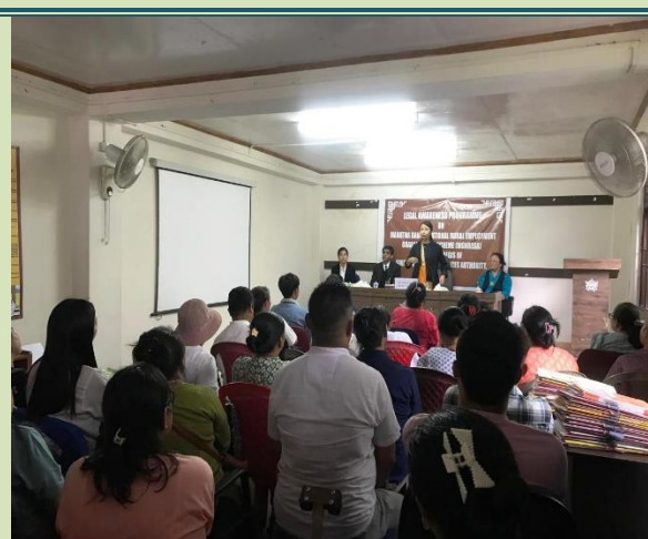
Singhik Sentam GPU, Mangan District