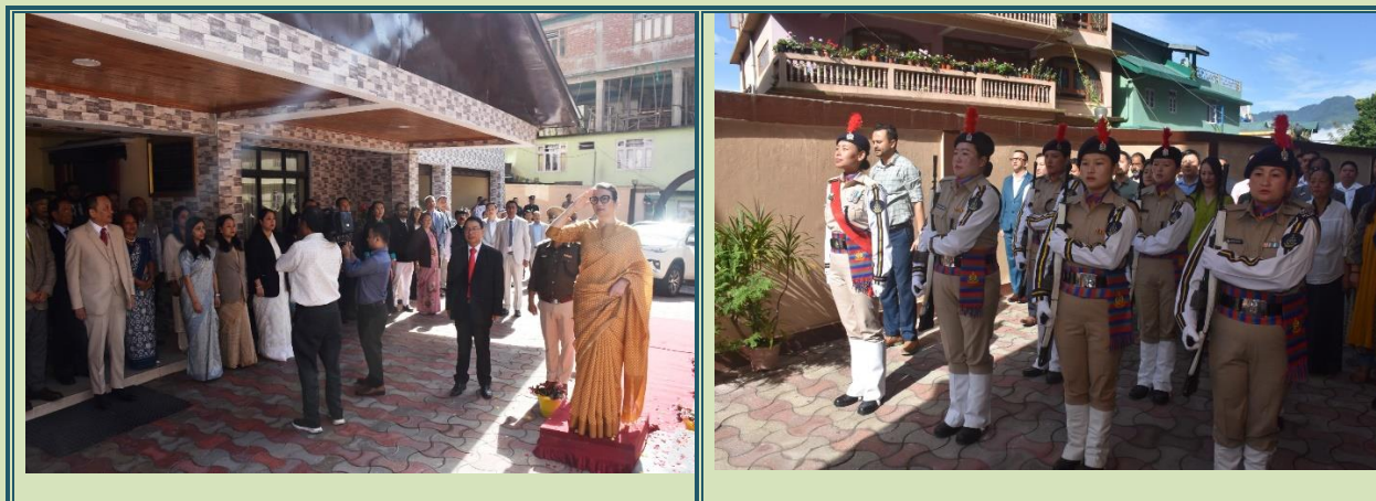
78 th Independence Day on 15th August, 2024 in its office premises at Development Area, Gangtok

The programme has been uploaded in the official Facebook page and website of Sikkim SLISA.