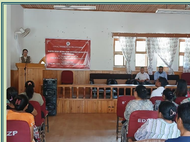
Block Development Office, Rongli, Pakyong District