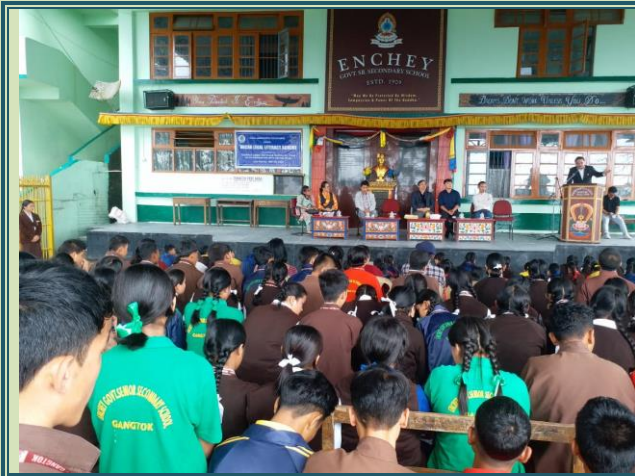
Government Senior Secondary School, Enchey, Gangtok District