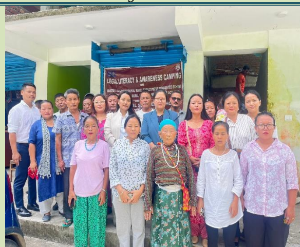
Samaj Ghar, Near Government Primary School, Tikjeck, Gyalshing District