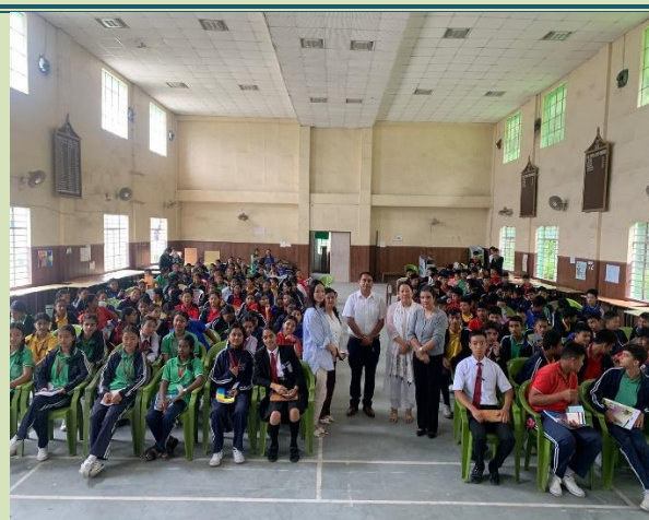
Government Senior Secondary School, Samdong, Gangtok