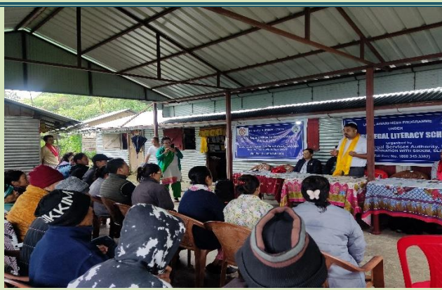
Lee Aal Sang Destitute Home, Tintek, Gangtok District