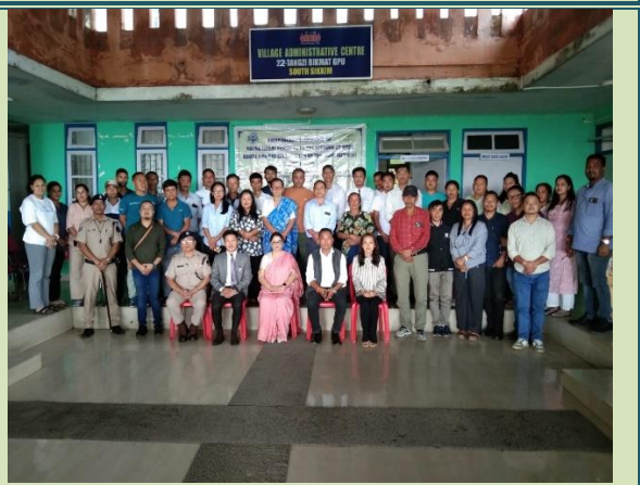
Village Administrative Centre, 10-Tanzi-Bikmat GPU, Namchi District