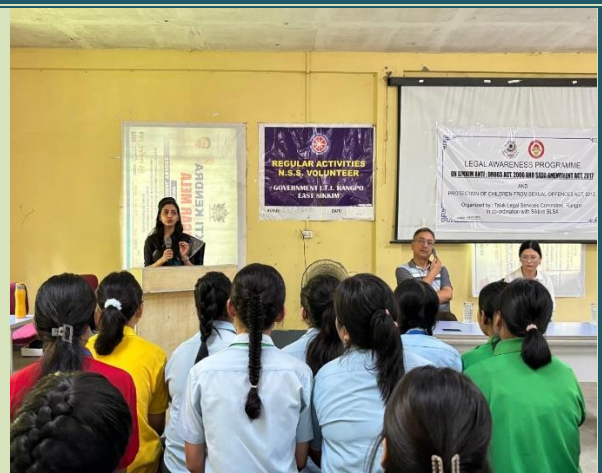
Industrial Training Institute, Rangpo, Pakyong District