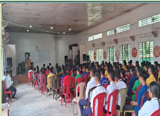
Government Senior Secondary School, Machong, Pakyong