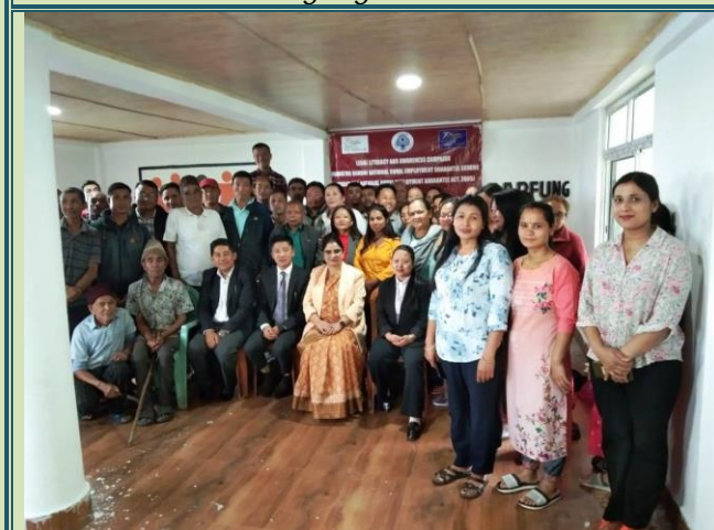
Dethang, 52-Barfung-Jarrong GPU, Ravangla, Namchi