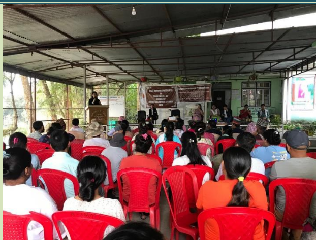
Government Arts College, Mangshila, Mangan District