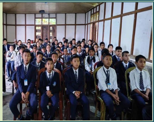
Government Secondary School, Chumbung, Gyalshing District