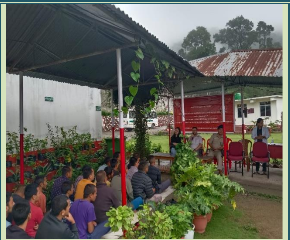
Mental Health Camp at District Prison, Boomtar, Namchi District on 20 th September, 2024