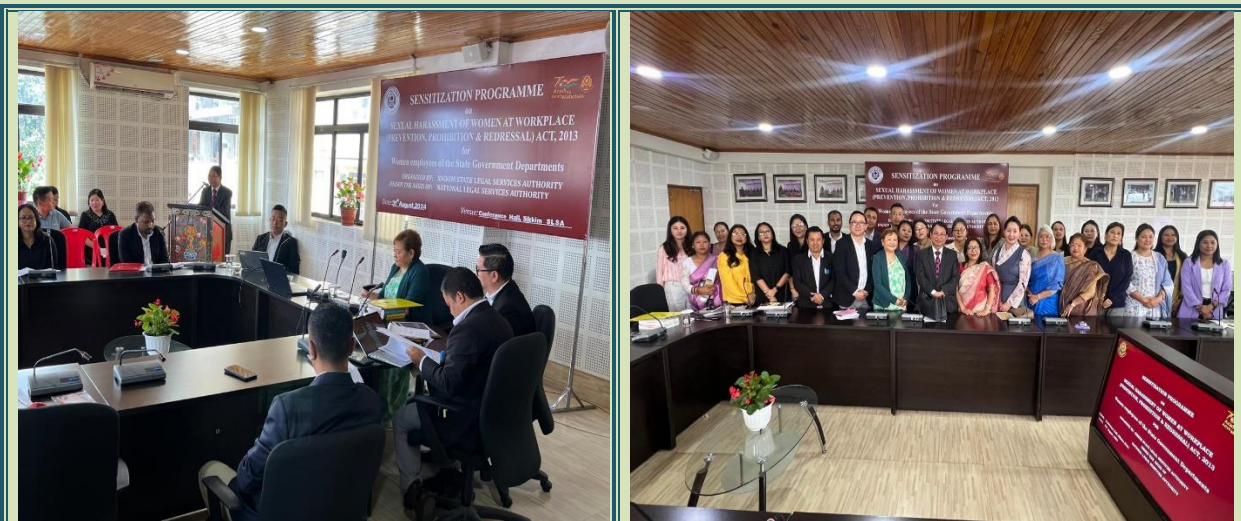
Sensitization Programme on Sexual Harassment of Women at Workplace (Prevention, Prohibition & Redressal) Act, 2013 for female employees and Members of Internal Complaints Committee of Sports and Youth Affairs Department, Government of Sikkim organized on 31 st August, 2024 at the Conference Hall of Sikkim SLSA, Development Area, Gangtok.