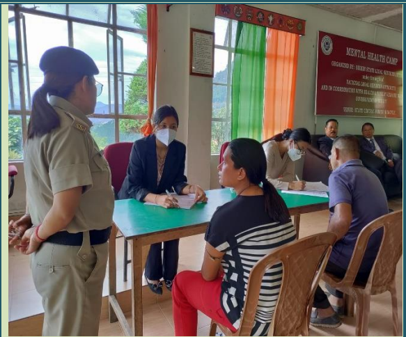
Mental Health Camp at State Central Prison, Rongyek, Gangtok District on 20 th September, 2024